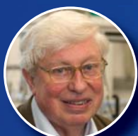
Gerhard Ertl Nobel Prize 2007