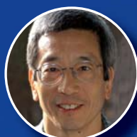
Roger Y. Tsien Nobel Prize 2008