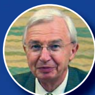
Jean-Marie Lehn Nobel Prize 1987