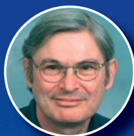
Alan R. Fersht