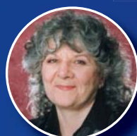
Ada Yonath Nobel Prize 2009